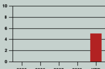
Decile ranking in discrete annual periods. 1st decile shown as rank 10, 2nd decile as rank 9, etc. to 10th decile as Rank 1.

Further information on S&P's fund coverage can be found at www.FundsInsights.com